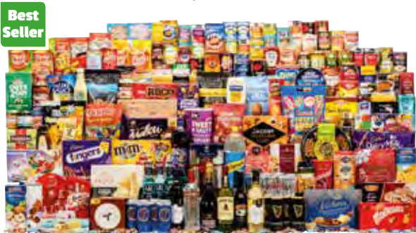
Best Seller Empire Hamper - p 28-31 All the food and drink you'll need for Christmas and beyond!