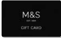
Marks & Spencer - p 13 From gifts to food the choice is yours