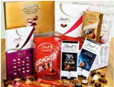
Confectionery - p 42-47 Christmas goodies galore