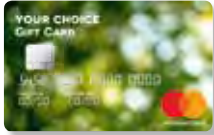
Your Choice Card - p 6-7 Shop anywhere that accepts Mastercard - 10% charge applies. See p22/23 for T&Cs